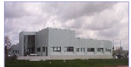
Current Aurora Loan Services location on Fifth Avenue